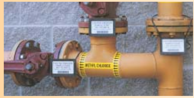
Tags for Fugitive Emission Test Points